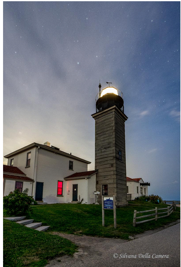
Photo Walk - Neds Point Lighthouse Sunset and Star Trails

Let's explore the beautiful Neds Point Lighthouse at night. We will start our walk at golden hour, we will photograph the sunset, continue exploring the changing light right through to darkness and also photograph star trails.