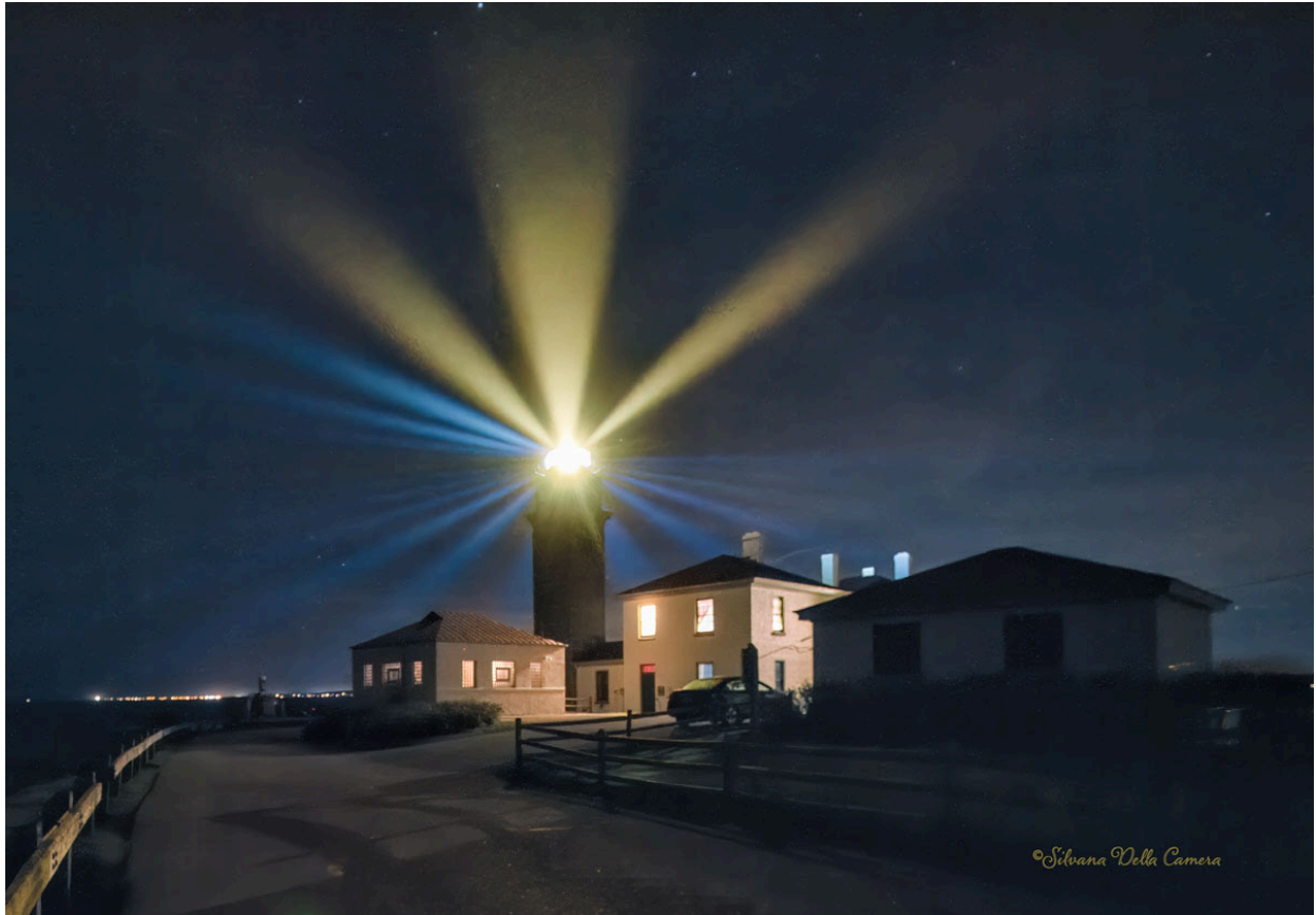
Photo Tour - Milky Way in Acadia National Park 2024