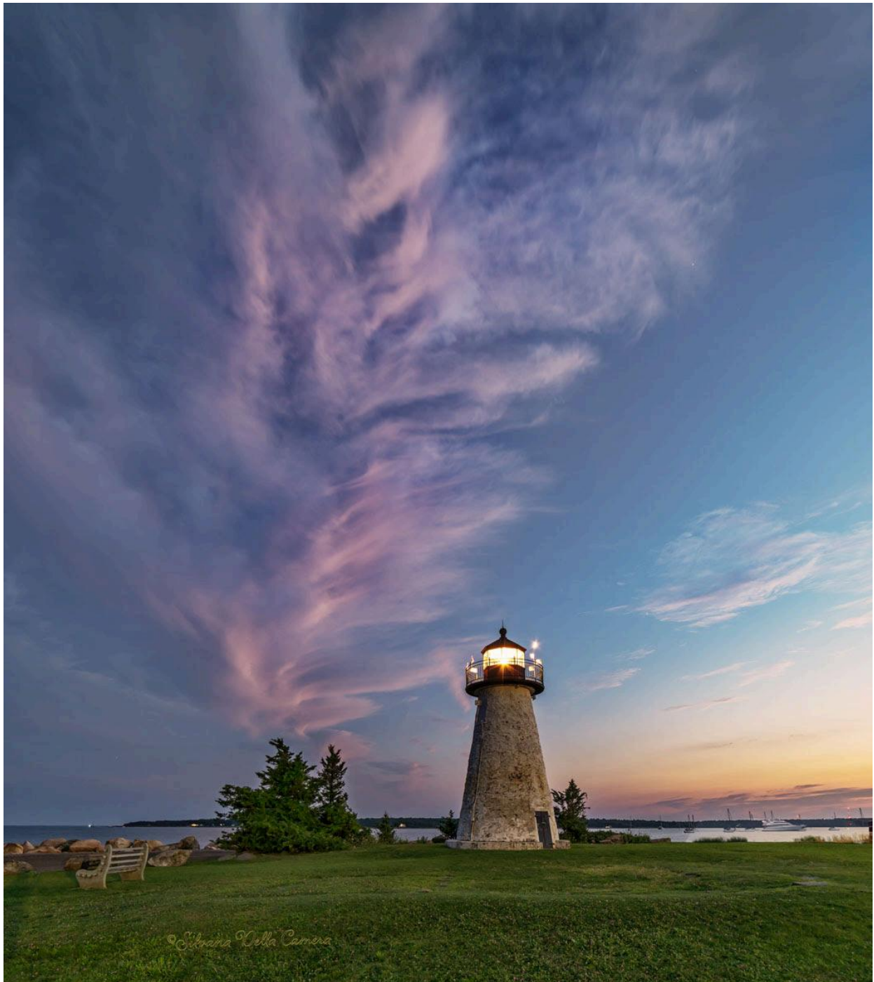
Photo Walk - Scituate Lighthouse Sunset and Star Trails - August 17th, 2024