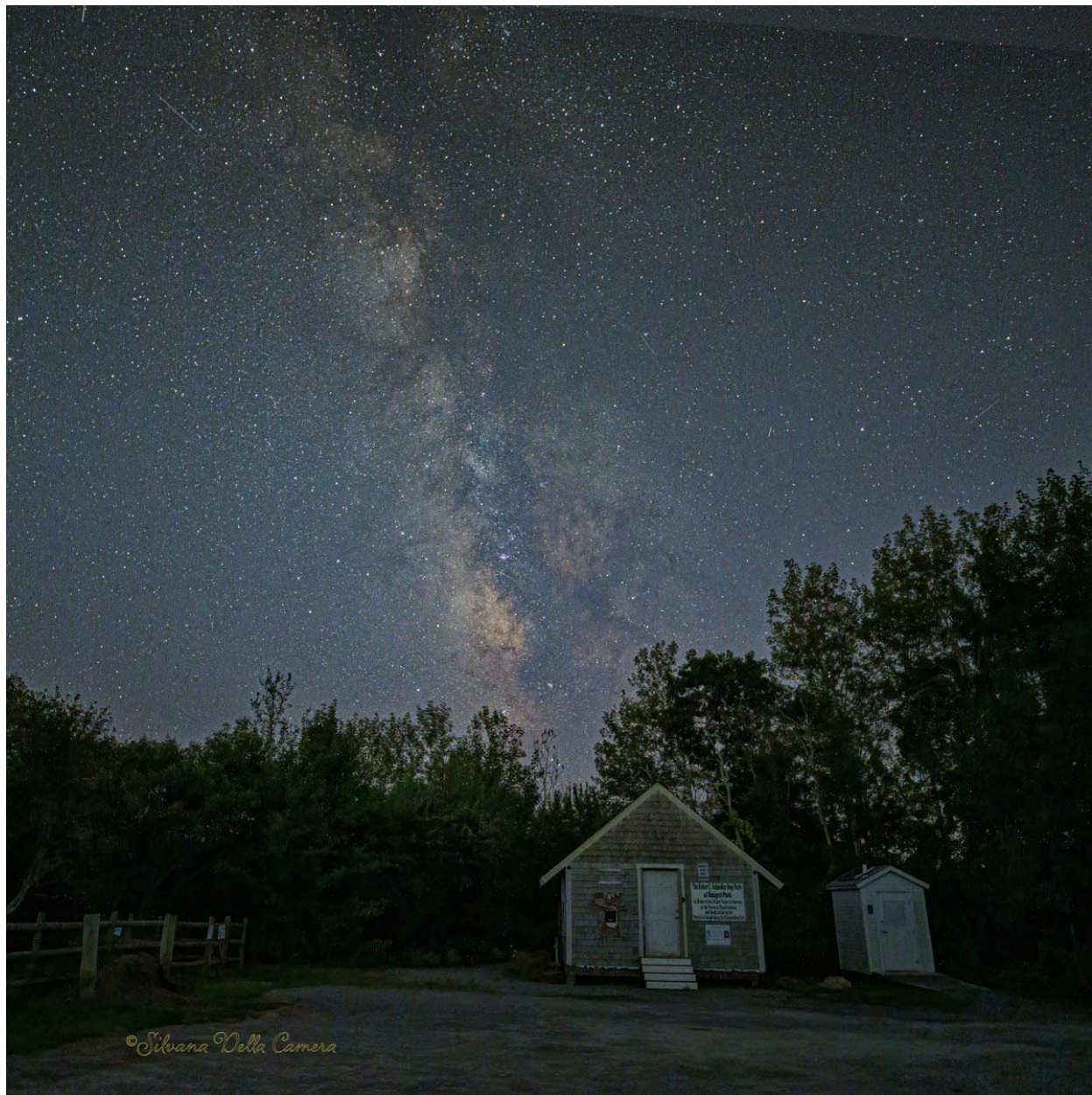
Gear Review: Viltrox 16mm f/1.8 Z